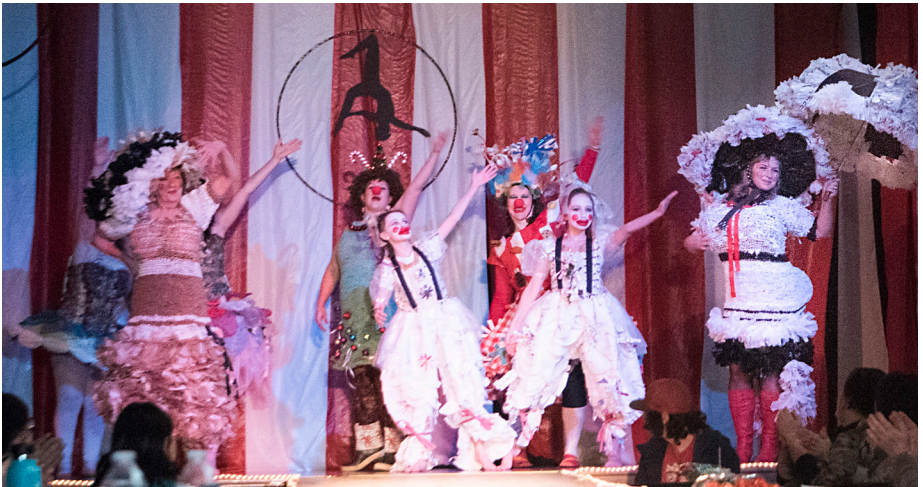
"Tears of a Clown" - a compilation of work by artist Lynn Jorgensen

1,524 people attended the Wearable Art Show in 2019. The Wearable Art Show netted $43,669 in operating support for the Ketchikan Area Arts and Humanities Council.