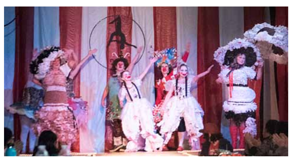
"Tears of a Clown" - a compilation of work by artist Lynn Jorgensen

1,524 people attended the Wearable Art Show in 2019. The Wearable Art Show netted $43,669 in operating support for the Ketchikan Area Arts and Humanities Council.