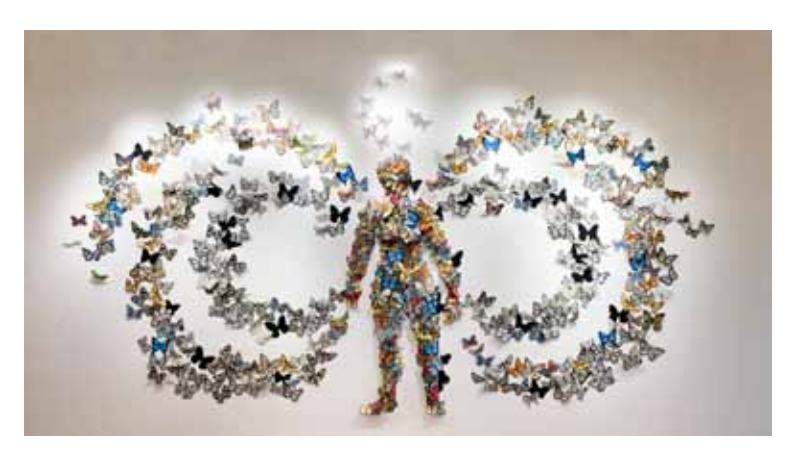
MERGE - May 3-24, 2019 New works from artist Evon Zerbetz, as she considers mecahnical and organic themes in dimensional linocut constructions.