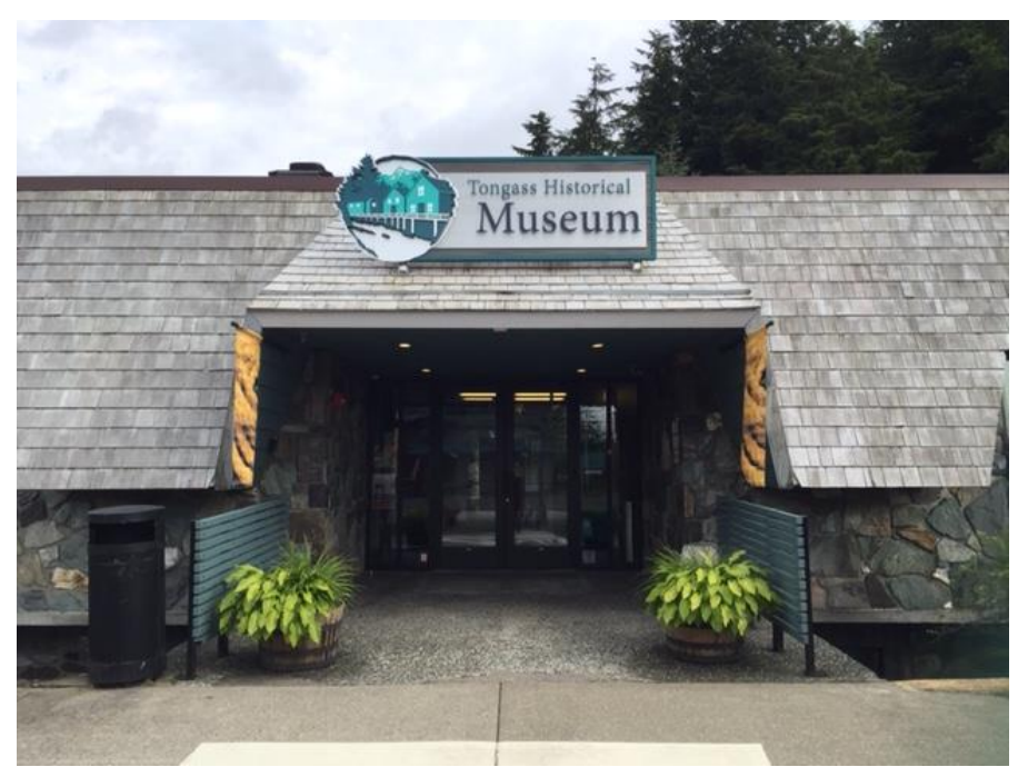
Figure 5 Main entrance of Museum