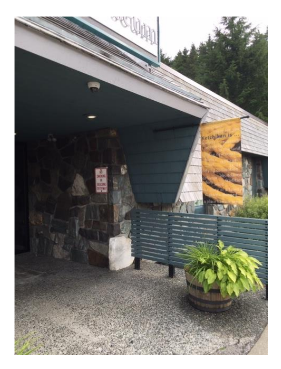
Figure 9 Right side of main entrance. Future ADA access button