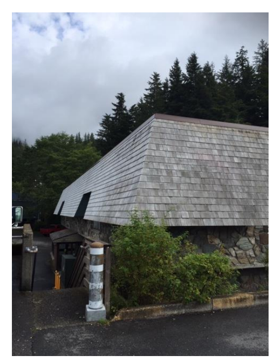
Figure 1 NW Corner of Museum