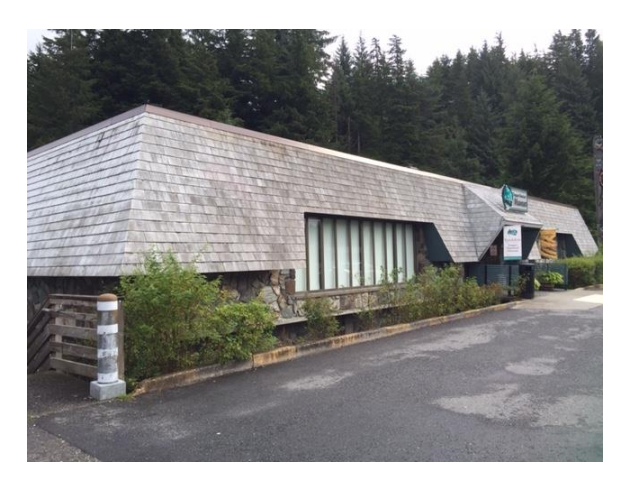
Figure 3 NW Corner of Museum, main entrance to the right