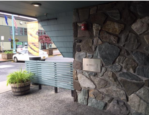
Figure 8 Left side of entrance with mail drop