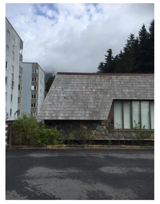
Figure 2 NW Corner of Museum