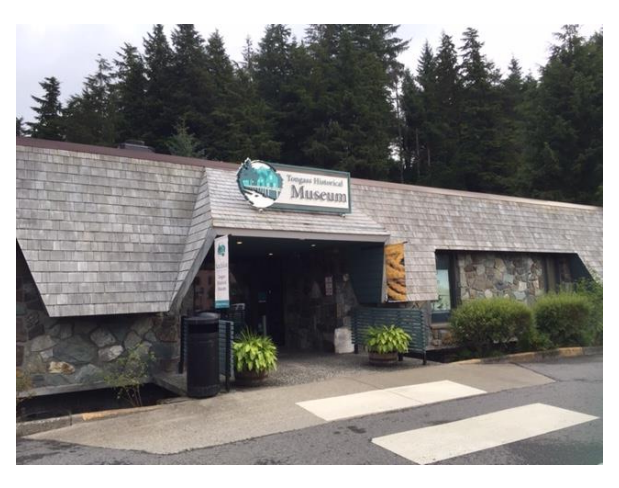
Figure 4 Main entrance of Museum