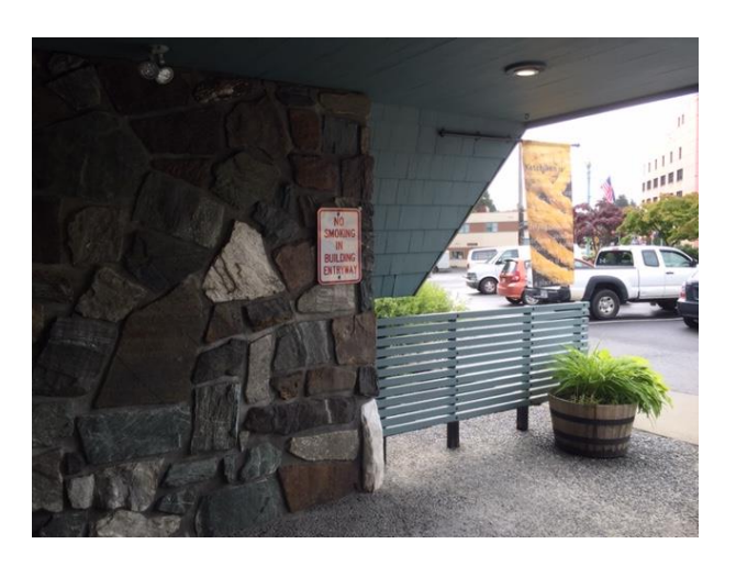
Figure 10 Right side of main entrance. Future ADA access button