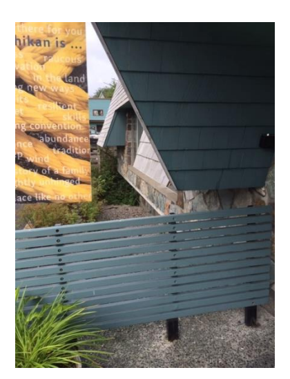
Figure 7 Left side of entrance showing drop off in front of windows