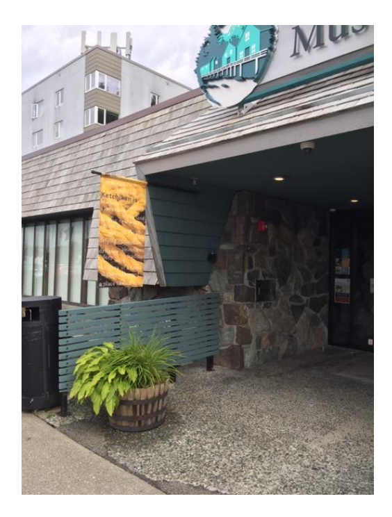
Figure 6 Left side of entrance with mail drop