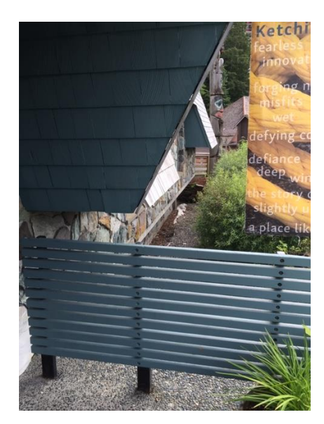
Figure 11 Right side of entrance showing drop off in front of windows